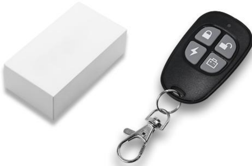
Remote control *1, Key chain *1, White box *1